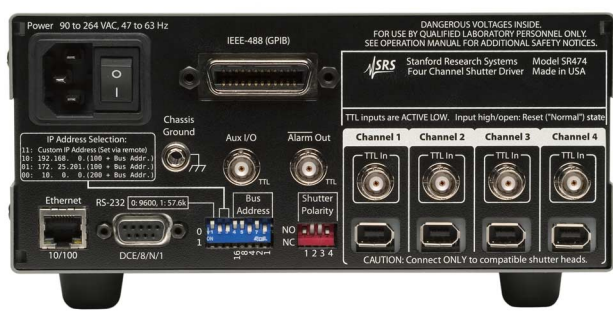
SR474 Rear Panel