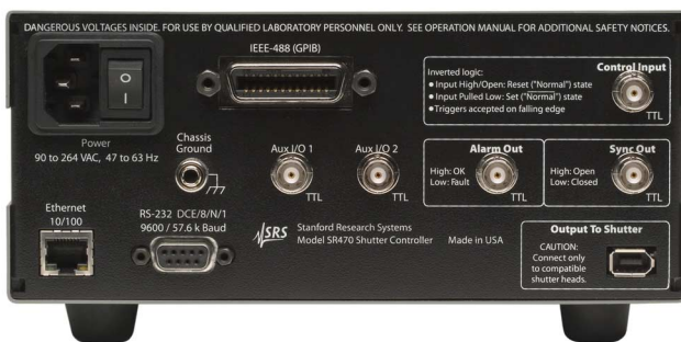
SR470 Rear Panel

The SR470 and SR470 Laser Shutter systems from SRS offer performance and reliability not found in other systems. For more details call us at 408-744-9040.